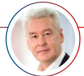
Sergei Sobyenin Moscow Mayor

Four expressways running across Moscow, the Central Ring Road, and outbound motorways will collectively expand the road network of the capital and the Moscow metropolitan area by about 2,000 km. The underground and surface metro, along with new major roads, will shape Moscow's new, modern transport framework, radically transforming traffic conditions in the capital and the Moscow metropolitan area.