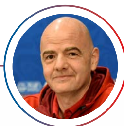
Gianni Infantino FIFA President

It is an incredible, amazing World Cup. This couple of years I said that the 2018 World Cup will be the best for all time. Now I can say it again, being convinced that this is the best world championship in history.